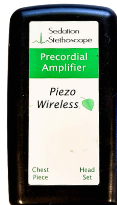
Green Piezo Wireless v. 3.0 2014