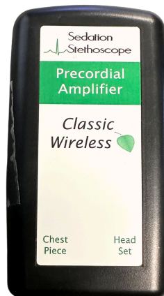
Green Classic Wireless v. 3.0 2014