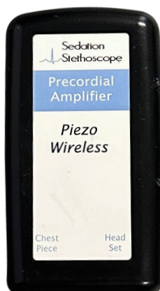
Blue Piezo Wireless v. 2.0 2009