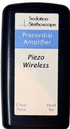
Blue Classic Wireless v. 2.0 2009

The Sedation Stethoscope® - Piezo version 5.1 is the most current version. As of May 1, 2024, we are no longer able to service the following amplifier versions: